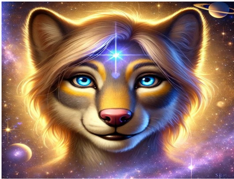
BlueHeart, a key figure whose love anchors the universe.

Key concepts like the Octave Mirror (which reflects a being's true self), Divine Matter (the immortal essence of all beings), and Bhakti Devotion (love as the ultimate creative force) provide a rich lore with endless storytelling potential.