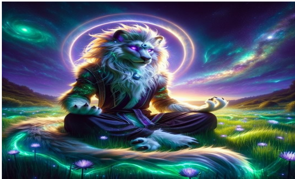
Divine Anthro, the loving heart of a new cosmos.

AnthroHeart is a vast, heart-forward universe designed for a generation seeking meaning, connection, and magic. Imagine the emotional depth of Frozen , the intricate world-building of Avatar , and the character-driven brilliance of Zootopia , all woven into a cosmic tapestry of love, identity, and radical redemption. This is a story of becoming, of finding one's true form, and of a love so profound it can give the Infinite Creator a place to rest.